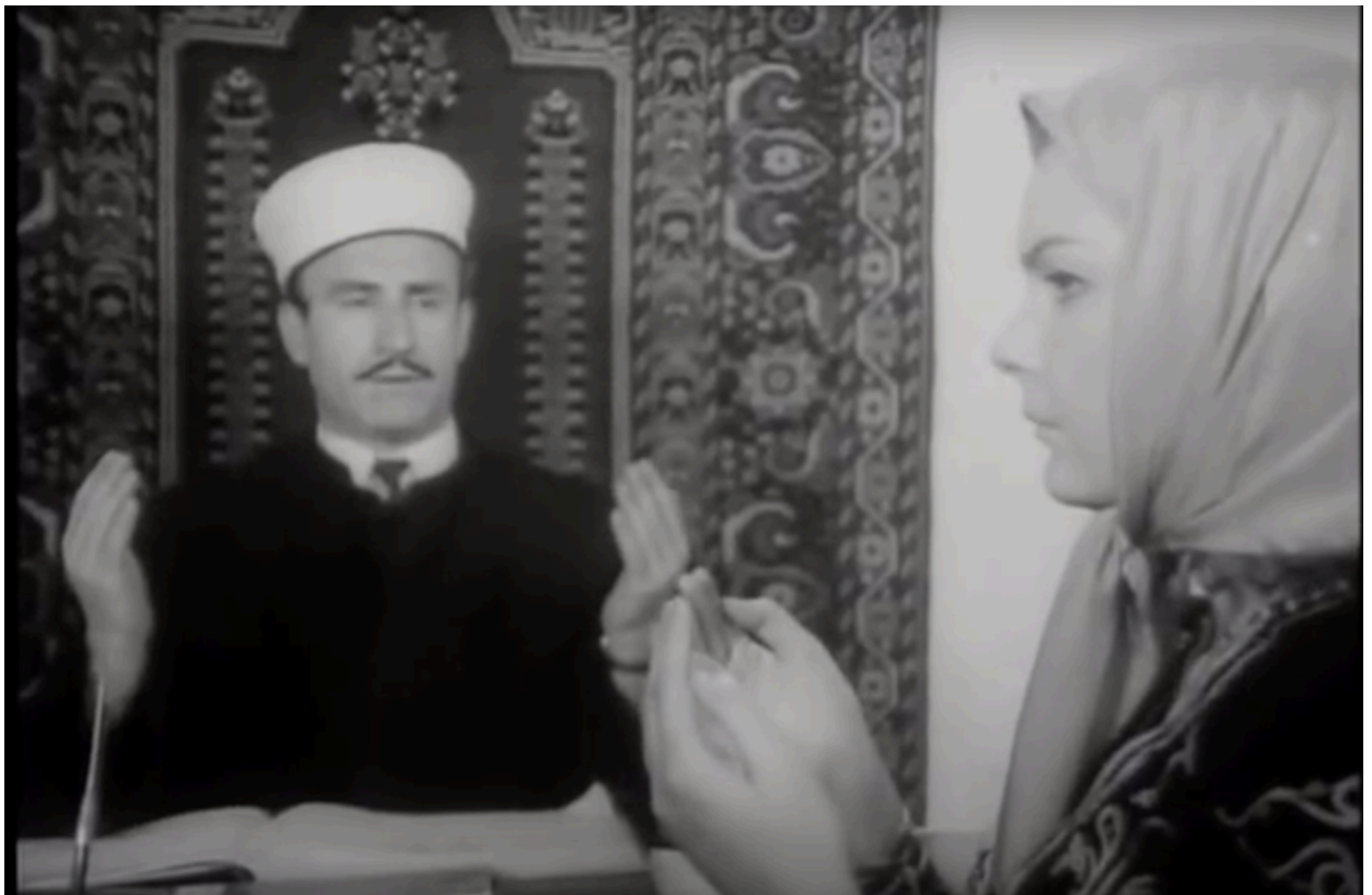
Figure 5: Eva's transformation is completed when she converts to Islam.

value with the consciousness of the necessity to adapt to modern way of life. The use of inanimate objects is significant in that case. There are peribacaları (the travanten stones in shape of human beings) that signify the natural heritage of the land. There is the old Byzantium church signifying the mixture with the old civilizations in Anatolia. There are mosques and old Küllüye (Seljuk and Ottoman religious and educational architecture). The villagers live in peace with the past a, present and the future. They are also aware of the problems of everyday life. They are trying to cope with the change, like building a water channel for better farming. Mustafa earns a living as a truck driver.