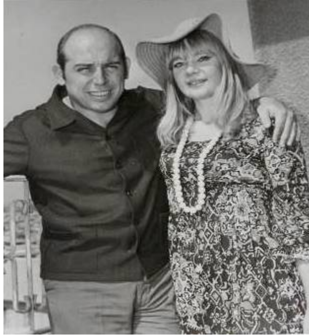
Figure 6: Eva Bender, the Swedish actress who played Eva in the film, was briefly married to the film's director, Halit Refiğ in the 1960s (Anon. 1969).