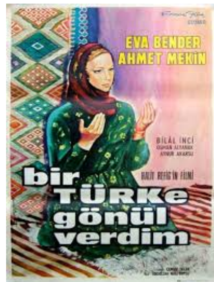
Figure 2-3: The two posters of the film I Lost My Heart to a Turk present the transformation of the German woman Eva into the Turkish woman Havva.