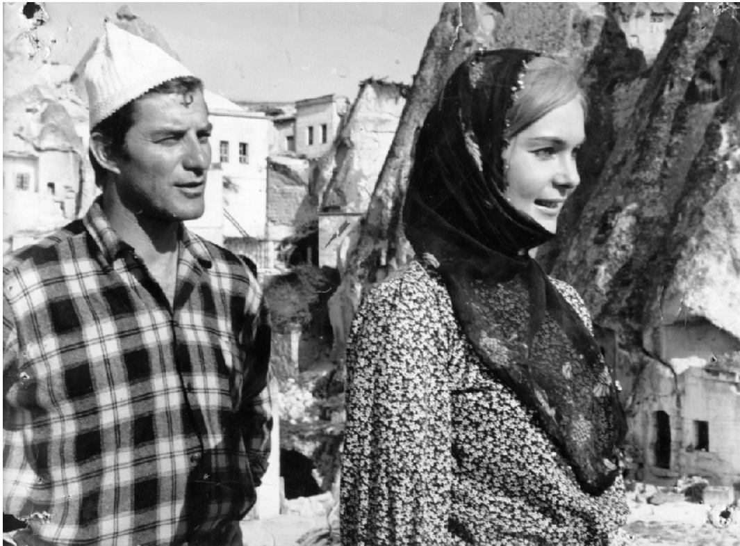
Figure 4: Eva finds true peace in Islam and the authentic Turk, Mustafa.

Eva finds true peace of mind in Islam. Eva first encounters Islam when she sees village women exercising their daily prayer. She imitates them and finds serenity. She later officially enters the religion through a ceremony and changes her name to Havva. As we have already mentioned, the mosques and minaret have an important presence in every sequence. Islam is presented as an inseparable part of Turkish national identity.