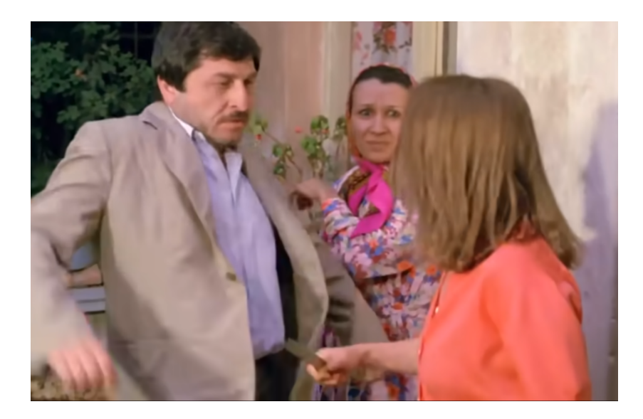
Figure 1: Aygül (Hale Soygazi) attacks her brother-in-law and sister-in-law