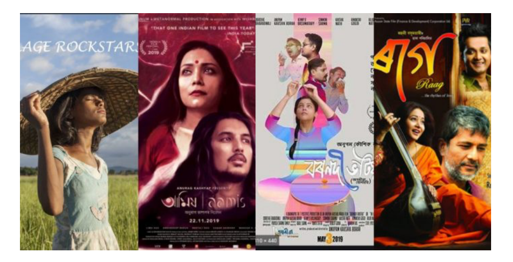
Figure 4: Posters from Assamese Cinema (clockwise)-Village Rockstar, Aamis, Bornodi Bhotiya, Raag<sup>10</sup>

In an interview,1961, Truffaut said the 'New Wave' is neither a movement, nor a school, nor a group, it's a quality. The contemporary phase has opened a new discourse on 'regional reality'. It is filled with stories, mostly from debut directorial which has created a buzz not only in their homeland, but their stories have reached national and international screens. "The more we see the screen as a mirror rather than an escape hatch, the more we will be prepared for what is to come" (Bazin, 1967:7). Cinema is trying to be a mirror for the transformation of the Assamese society which is in a complex state moving towards a new paradigm in every aspect. "North-east India, is flooded with visionary filmmakers; who, on almost zero support and budget, are being able to make a mark for themselves at various film festivals, both in India and abroad. Bagging National awards and entries to national and international film festivals, it seems the game has just begun. This is a whole new breed of filmmakers from the region, which has defined all odds and journeyed afar, to voice social concerns that need attention" (Goswami, Borah, Barbaruah, 2012:36).