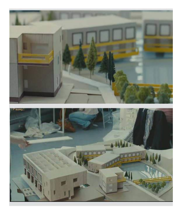
Figure 7. In the film Un Amaour de Jeunesse, students of architecture implement their projects via models

Apart from drawings, sketches and models, we see that in the films 500 Days of Summer and The Lake House, architects enjoy walking around the city to watch the buildings they like best, explore their details and making observations regarding the buildings in the city. In 500 Days of Summer, Tom sits at his "favorite spot" in Los Angeles, a bench, and watches the Continental Building for hours. He sits on the roof of a building and makes sketches of buildings in the sunlight, which changes throughout the day. In The Lake House , Alex likes, on a day when the lights are very clear, walking in the streets of the city and "touching" the details of the buildings. Observing the city they live from an archaeological perspective and thus feeding their visual memory is a method of working that architects often resort to.