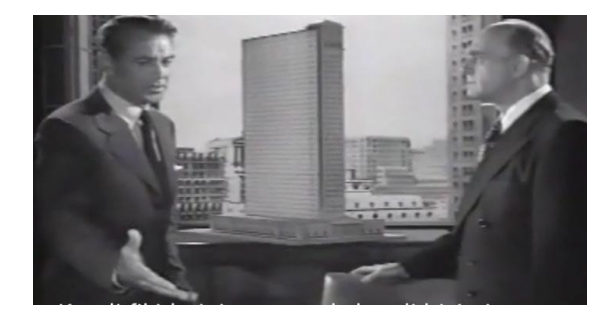
Figure 12. The architect's struggle with the employer for whom he works (Fountainhead)

When employers say "you have not done business for months; this is your last chance; you can never find clients", he responds saying "I will not make drawings to gain clients; I gain clients to make drawings", which emphasizes that in fact process is as important as result (Figure 12).