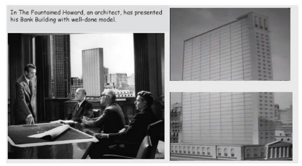
Figure 6. In the film The Fountainhead, architect Howard presents his project proposals on models

In a scene in the film The Fountainhead, we see Roak's proposed skyscraper model, which has been detailed quite professionally. The employers insist that forms taken from history be added to Roak's modern and unique skyscraper proposal and again additions are made on the model. It is unclear whether this detailed skyscraper model has been prepared by Roak or the employers (Figure 6).