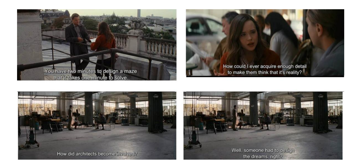
Figure 14. Various ways in which architects get jobs (Inception)

The fact that architects cannot refuse the opportunity of making designs in a world where physical rules do not apply is an example of the fact that architects sometimes accepts a job for the sake of process, not for the result (Figure 14).