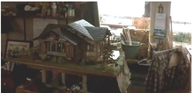
Figure 5. The model is one of the means of expression for architects (Life as a House)