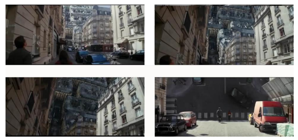
Figure 10. Inception and mental architecture

physical world, and conducts experiments of design concerning what might happen if she furnishes the city with mirrors (the mirror command in CAD programs). Although she works in this manner in her dreams, in the physical world, she shares her dreams with others using models, sketches and models in three-dimensional computer programs (Figure 10).