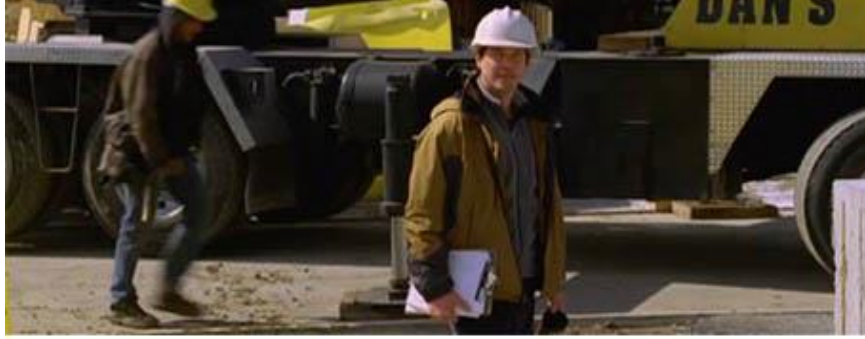
Figure 8. Architect at the Construction site (The Lake House)