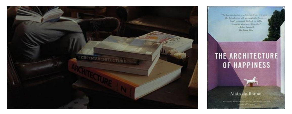
Figure 16. The profession of architecture is seen as a way of resurrecting one's self