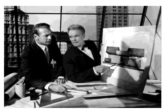
Figure 1. Howard Roak's project presentations in the film The Fountained The film also shows the latest forms of various buildings. Roak usually prepares his projects with presentations of sketches containing technical drawings consisting of plans, cross-sections and façades (Figure 2).

speeches in the name of his profession, or as a worker with a tool he uses to bore stones and dressed in dungarees, the general image of him is one of an architect engaged in sketches and drawings. He prefers to make presentations to employers with elaborate and well-proportioned sketches on which he put his signature (Figure 1).