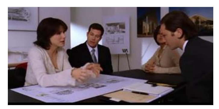
Figure13. The reconciliatory attitude that the architect assumes towards the employer for whom the design is made (The Lake House)

alterations in accordance with their demands. The film The Lake House lays before eyes various aspects of architecture, and by ending the final scene in a frame where the House and two happy people going to it, emphasizes that architecture is an endeavor aimed at bringing happiness to people (Figure 13).