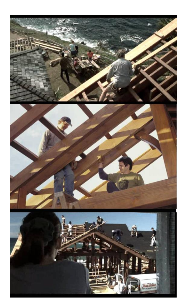
Figure 15. The architect builds human life as well as a building (Life as a House)

In the film 500 Days of Summer, the architect is depicted as having an ordinary life. He experiences failure, seeks ways of fighting, and makes psychological analyses and syntheses on an architectural task in which he prepares the skyline of the city (Figure 16).