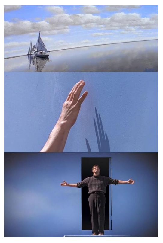
Figure 17. Architect and architecture are so presented as to touch upon the realities of life

real world of which he will not only be an actor but also the director, Truman gives a final salute to the viewers in front of the EXIT door as if out of spite to the director and manages to go through the (Figure 17).