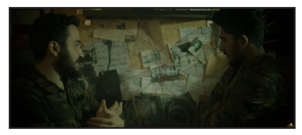
Figure 3: Kapalak Kızı (2018)

a horror film called Kapalak Kızı . The story of the film was inspired by the events that a young girl, who was a servant in a village school, experienced. On the other hand, there are some short and long YouTube videos on the YouTube channel related to the subject of the abovementioned film: the film is both related to the content of the YouTube channel and a continuation of the content on the YouTube channel.