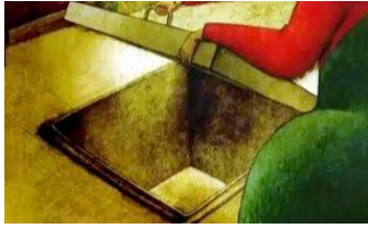
Fig 4 The old man opens the damper

In ancient times, a deep trace was being opened to make a holly border which was called as pomerium. Kato creates a kind of pomerium which causes a periphetic action. The damper is a pomerium in which old man's pipe disappeared, and it is a way to reach to the other flats of house under the water.