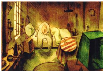
Fig 5 The flat of old man

In ancient times, a deep trace was being opened to make a holly border which was called as pomerium. Kato creates a kind of pomerium which causes a periphetic action. The damper is a pomerium in which old man's pipe disappeared, and it is a way to reach to the other flats of house under the water.