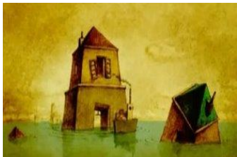
Fig. 1 The house of old man

According to Mescallado; the popular Japanese animated cinema depends on comics and this element is constituted by the mediation of local culture and thought (Mescallado 2009). On the contrary, classical Japanese animated cinema has not popular culture artifacts, and it follows the way of traditional Japanese art. Hence, technics of classical Japanese animated cinema depends on traditional arts with the dimension of content and form. The scenarios inspire of