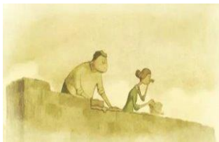
Fig. 2 A scene from past; the old man and his wife are building the first flat of their house

companionship with poetic visualization and vulnerable music. Repetition also possesses the quality that Agamben defines as the second transcendental condition of cinema: stoppage. This is where the difference lies between cinema and narrative; The relations between visualization and movement can be better appreciated by distinguishing between the specificity of film qua film, especially as it came to be known in the opening decade of the 20th century, and the earlier technologies of chronophotography and animated photography, often referred to as film before film. The latter's initial fixation on conceiving of matters in terms of immobile images to which movement could be added, rather than as 'movement-images' per se, is, for Deleuze, a matter of evolution from a set of initial technological conditions, paralleling the way life struggled to distinguish itself from matter: Agamben proposes: 'stoppage shows us that cinema is closer to poetry than prose'. Drawing an analogy with Paul Valéry's definition of poetry as 'a prolonged hesitation between sound and meaning (Clarke and Doel 2009: 112-114).