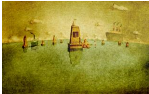
Fig 6 The city in which the old man lives

his living space which remembers the passing of time. He carries his items to his new flat of his building and to the new phase of his life. Every flat refers to a new life experience. The every flat covered with the water is his past life. The rising of the building is ascending to the sky. Space narrows; time passes, body grows old.