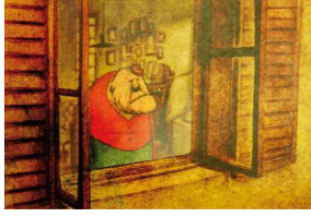
Fig 3 The room of old man