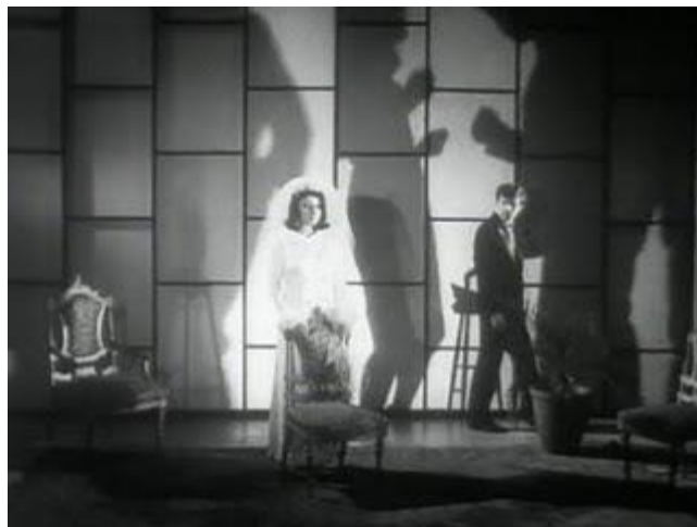
Urban western life presents only shadows of the real in Time to Love

Other westernized figures like Başar and Meral's father are rich, high-class but corrupt figures. Başar's very name literally means 'succeed' in Turkish, and he is the representative of carnal instinct and love in opposition to Halil's pure and idealistic love. For instance when Meral first tells Başar about Halil, Başar does not care. Meral tells Basar that she cannot love him. Başar says he only wants to have Meral sexually, and her spiritual commitment to Halil is not important. Meral's father surprises us at first when he tells Halil that his daughter could not have made a better choice of husband. He says it is important to have moral values and lead a difficult life to earn a living. He seems to appreciate Halil and even says: 'see I don't sound like the other fathers!' But he discourages Halil even worse than any other conventional father. He says that Meral herself will get tired of Halil sooner or later because she is used to living a luxurious life. So in the case of Başar and Meral's father we see the western-oriented side characters as morally corrupt.