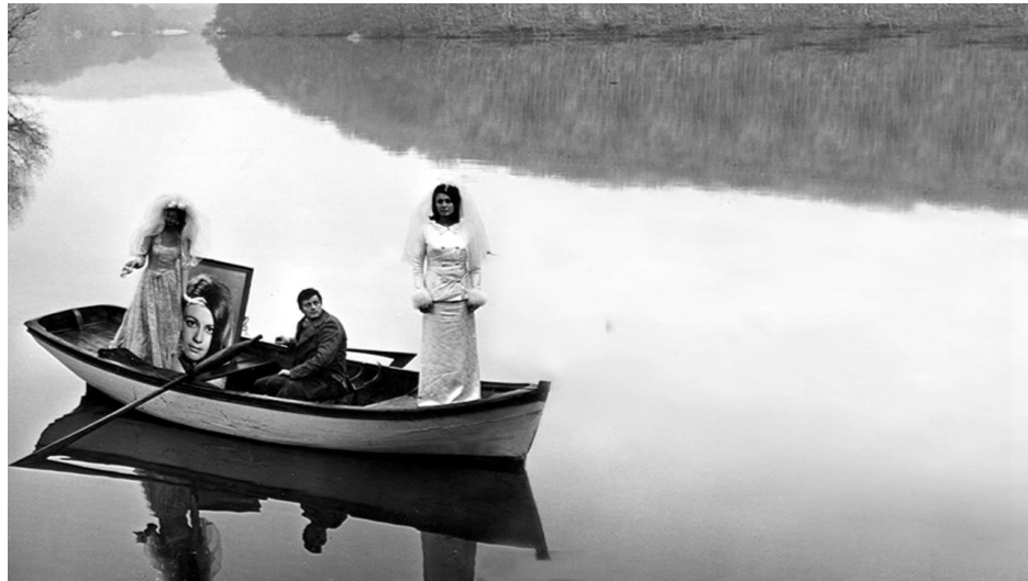
Love at its most abstract in Time to Love

To sum up Time to Love is a work of national cinema in terms of its content. It could not be viewed by Turkish audience in the year of its production, so in terms of production and exhibition it seems to have problems. But after 20 years of its production it has formed a cult audience through another medium, the television. Time to Love tells the stories of two lovers that represent eastern and western values in an attempt to reconcile, make a synthesis like Turkey tries for the last two centuries. Also, Time to Love is the work of a director who believes that the director is the sole creator and owner of the film. Although Metin ERKSAN belonged to a group that had the self-acclaimed name National Cinema Movement , he also had his vision of the universal as well as the local. His humanistic approach to eastern myth in Time to Love is, in fact, the reconciliation of western art in the Turkish context through his unique work: Time to Love .