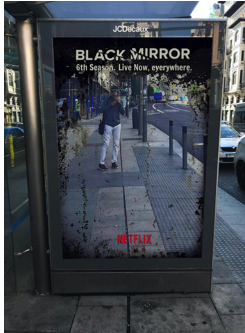
Figure 1. Brother Ad School Spain created the outdoor advertisement inspired by the Covid-19 pandemic for Netflix.

The list of films related to surveillance is potentially infinite. Many audiovisual products recall, often only marginally, such an omnipresent topic within cinema's history. Movies like The 1000 Eyes of Dr. Mabuse (Lang, 1960), The Trial (Welles, 1962), Fahrenheit 451 (Truffaut, 1966), Blow Out (De Palma, 1981), 1984 (Radford, 1984), Brazil (Gilliam, 1995), Gattaca (Niccol, 1997), Lost Highways (Lynch, 1997), Following (Nolan, 1998), Panic Room (Fincher, 2002), Minority Report (Spielberg, 2002), Caché (Haneke, 2006), The Lives of the Others (von Donnersmarck, 2006), Citizenfour (Poitras, 2014), Await Further Instructions (Kevorkian, 2018) allow cinema to dive into the cryptical world of surveillance in different ways. Each transposes the adaptation of renowned Orwell and Dick's science fiction novels or the cryptic lens of Kafkian bureaucratic