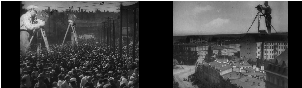
Figure 2. These superimpositions display Mikhail Kaufman's eagle eye over the town and people's lives.

The tradition of reflexive cinema contains many examples that restate or criticize the mediatic apparatus's surveilling character and its various scopic regimes. They function as wake-up calls for the spectator by revealing the production mechanisms, the linguistic and technical devices which underlay cinema's surveilling nature.