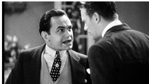
Figure 2: Edward G. Robinson arguing with Douglas Fairbanks, Jr. in his breakthrough performance in Little Caesar (1930).