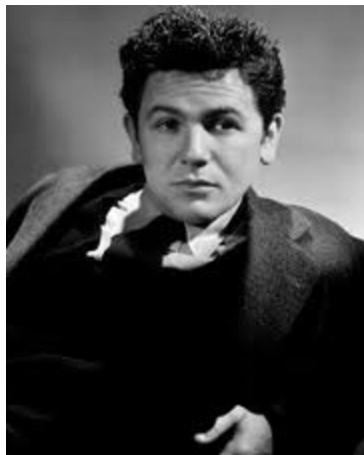
Figure 3: John Garfield in 1938, when he appeared in Warner Brothers' Four Daughters , receiving his first Academy Award nomination.