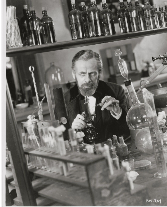
Figure 1: Paul Muni in his Academy-Award winning performance from The Story of Louis Pasteur (1936).