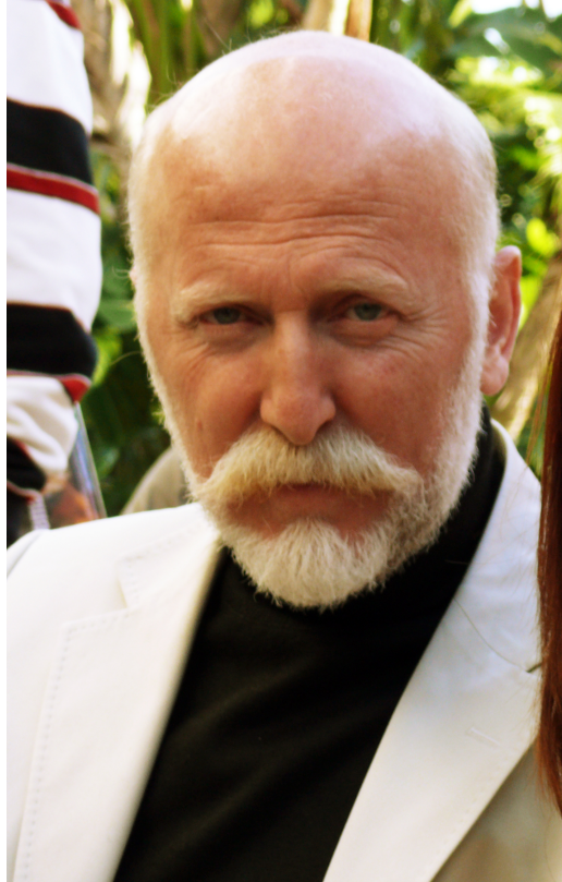
Figure 5: Director Semir Aslanyurek

and thought-centered narrative. His films thoroughly shed light on the history of the Republic of Turkey and Antiochia, beginning from the late Ottoman period.