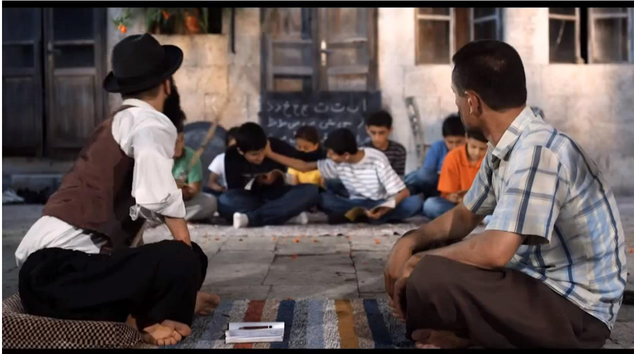
Figure 3: One of the courtyards in 7 Yards.

At her home, Eleni prays to the Virgin Mary in tears presenting the audience with the universalist message of the director as follows; “Why are we suffering? Why are people so cruel, why do they behave badly each other, when will we learn to be happy? Aren't we all children of God? Aren't Turks, Armenians, Jews and Arabs all children of God? Why does God allow cruelty?” .