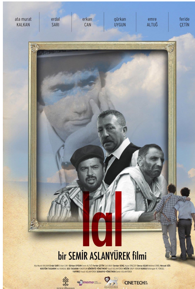
Figure 4: Poster from Lal/Speechless

after a police raid together with the people who are trying to enter the iron and steel factory as workers. Süleyman survives of birching because he is speechless, but Cemal is not so lucky. He's been badly beaten and his health is very bad. At the end of their journey, his life also ends. Unfortunately, Yılmaz Güney has been imprisoned because he killed a public prosecutor, and could not finish the film. Süleyman, who started to talk, is in front of a banner with a picture of Yılmaz Güney, but he can't bring his friend back to life. The film ends.