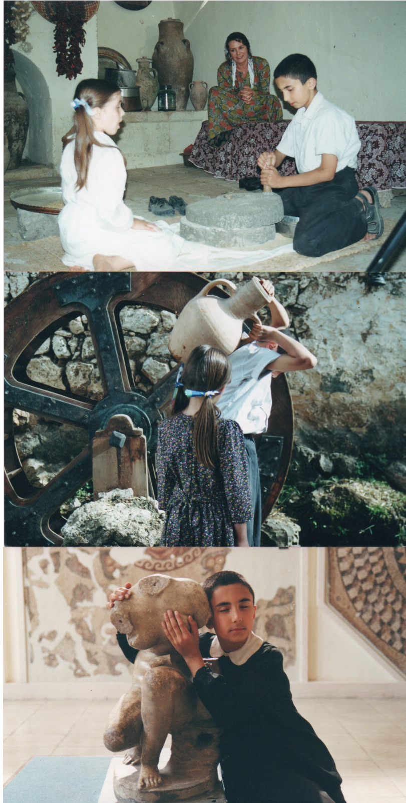
Figure 2: Child characters of Sellale