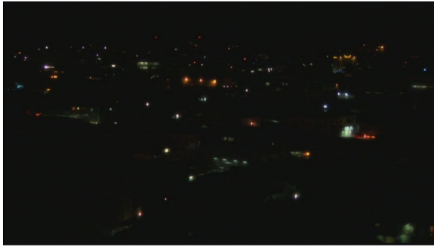
Figure 1: Situational shot on the town of Douala