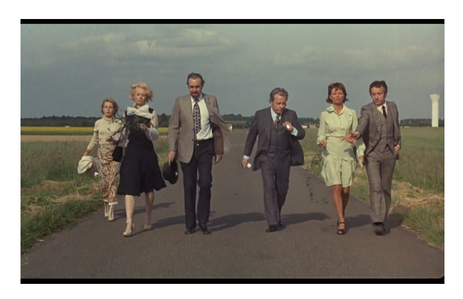
Figure 7: The never-ending road of limbo as the guests never reach their destination.

What we gather from the dream-realisms is several illustrations of how a series of dinner parties "can do as little to preserve their participants from the emptiness which society has sowed within their hearts as communing with nature could do to redeem the Victorian middle class from its materialism" (Durgant, 1975, p. 52). The liminal limbo of the bourgeois blossoms into the fear of the material through a raucous atmosphere. These dinner parties conspire to be a form of potlatch, although we never see one fully completed, as the open road scenes break in, which show the group continuously walking on several occasions in the film. Perhaps this particular liminal space of emptiness and uncertainty is a meeting point where their lives intersect. It is noteworthy that Bunuel's own feeling towards open spaces lends its hand to this form of constraint; perhaps the horror of this open space is the never-ending road to limbo.