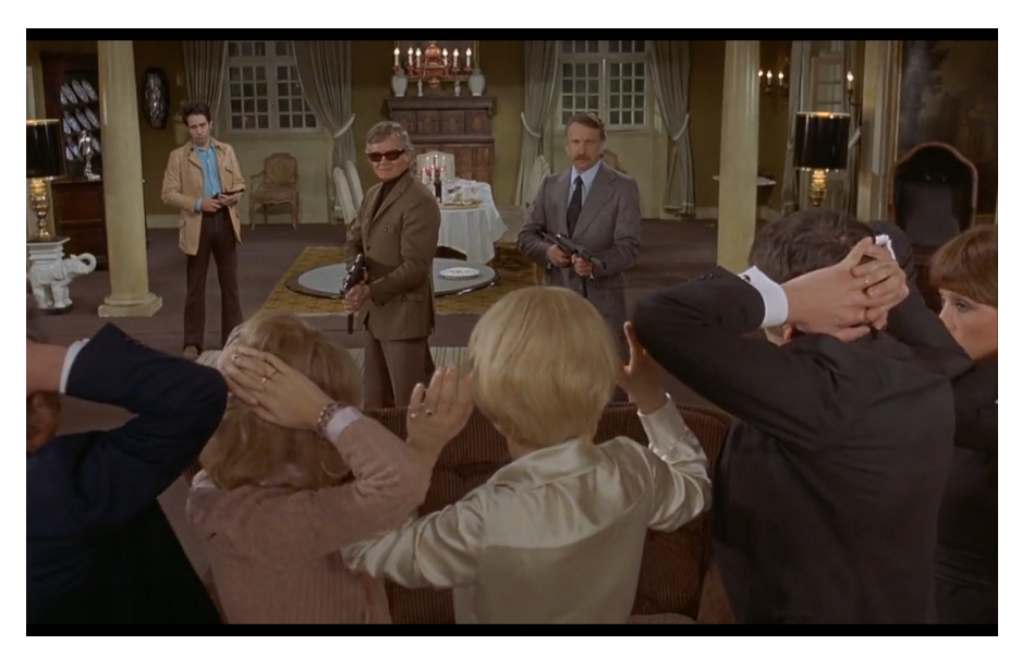
Figure 6: The Massacre! The Ambassador's dream, as his rivals arrive and gun down the guests.

As it becomes nearly impossible to distinguish the boundaries of realities and dreams, we reach the climax of these disruptions during the ambassador's dream. Gangsters, who are a part of a Marseille gang, interrupt this gathering, claiming to be the rivals of the three bourgeois men in the heroin business. They proceed to gun down the guests, execution style, while the ambassador finds cover under the dining table. All the dream-sequences lead up to this apocalyptic event, facilitated by the ambassador's greed and hunger. This is translated in not only his cowardice as shown not only by his abandonment of his friends to hide under the table but also by his continuous hunger for power. Even as he sits there, defeated, the ambassador reaches out from beneath the table to grab a piece of lamb, thus showing that he is not yet satisfied, whether psychically or mentally.