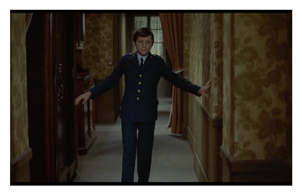
Figure 3: The young soldier as a kid walking down the hallway of death.

for something that is not in fact there. Although told separately, the dreams and memories of the lieutenant and sergeant are similarly juxtaposed in a third space. For the lieutenant, this is represented by the hall, and for the sergeant, by an empty street filled with shops, both of which lead to the ghosts of their pasts and their own frightening fate.