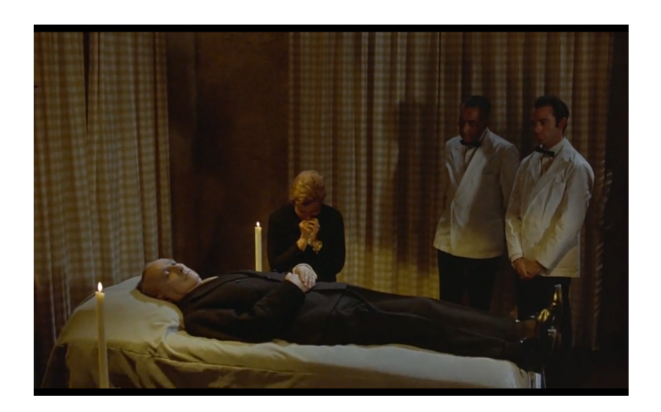
Figure 2: The corpse of the owner of the Auberge.

By the end of this scene, the characters become well situated in the third space. Unknown to them, the body of the owner of the Auberge is laid out in the room next to the dining hall; the scene hints at the bourgeois role of "man as carnivore." The formalist function of this scene acts as a "discordant reality based on the juxtaposition of instinctively felt opposites" (Osbourne, 2016, p.18) as the bourgeois troupe complains about the lack of expensive wine, "maintaining the social façade before passing through the façade of the Auberge" (Osbourne, 2016, p.19).