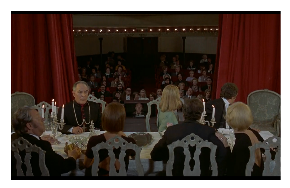
Figure 5: Surprise! The bourgeoisie find themselves in their own "theatrical" dreams, being looked at and judged by strangers in an uncomfortable setting.

as puppets of sorts, faced with performing in front of the audience, shows the weakness or perhaps flaw in the class-system structure. In the face of exhibitionism, our guests' "inner emptiness" has been exposed, and Bunuel reminds the viewer that "all these gatherings have been social performances" (Jones, 1999, p.46). By combining stage fright and anxiety with the preconceived idea that the guests know their lines by heart, the stage transforms into a third space where their exposure turns into the fear of becoming one with simple peasants, in the lieu of the capitalistic system they have created.