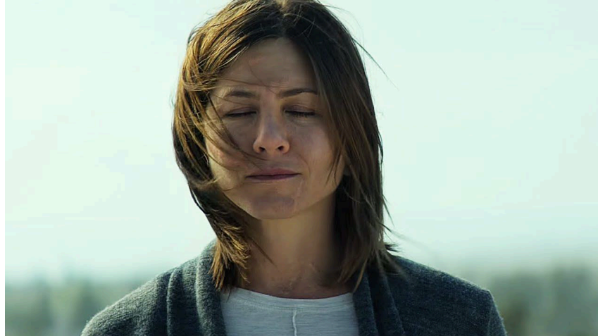
Figure 9. Preview image from the Cake trailer on YouTube.

Her representation of a body in pain is stunning, moving, visceral, and right on. But not quite enough – it still feels like a disguise.