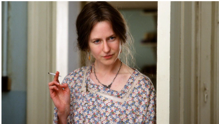
Figure 6. Nicole Kidman in The Hours.

How do we see her? Interestingly, there were far fewer stills accompanying these reviews than those of Monster . Many were drawn from the film's poster, which featured all three women, but in the Kidman-focused reviews, we are often shown Figure 6.