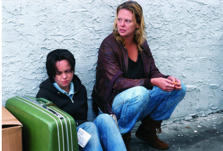
Figure 4. Charlize Theron and Christina Ricci in Monster . This promotional still from Alvarado, et al. (2003) highlights the size difference between Theron and Ricci's characters and Theron's attained bulk. Retrieved from http://www.imdb.com/title/tt0340855/mediaviewer/rm698857472 .

Figure 4 is the still that accompanied most reviews: chosen to highlight Theron's size, her presence – the shot is composed to make Theron loom large over the already small and here even smaller Ricci. It also shows the face, unrecognizable as Theron, of course, but also unfocused, looking in the distance in a classic scene of isolation...these people clearly have nowhere to go. Nicole Kidman doesn't fudge her size. She's tall, of course, but she's also in a way tiny. And as Virginia Woolf, she stays tiny in that sense, self-effacing, depressive, falling out of the frame rather than filling it. Is she unrecognizable? (Figure 5.)