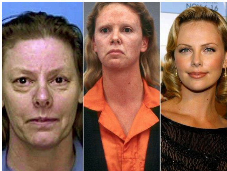
Figure 1. Aileen Wuornos/Charlize Theron in Monster /Charlize Theron comparison. Aileen Wuornos Charlize Theron side by side [Online image]. (nd).

I didn’t have to make these: the before-and-after shot is almost as common as the references to the transition in the reviews. And it’s not just curiosity, I think – there’s a real appreciation (in