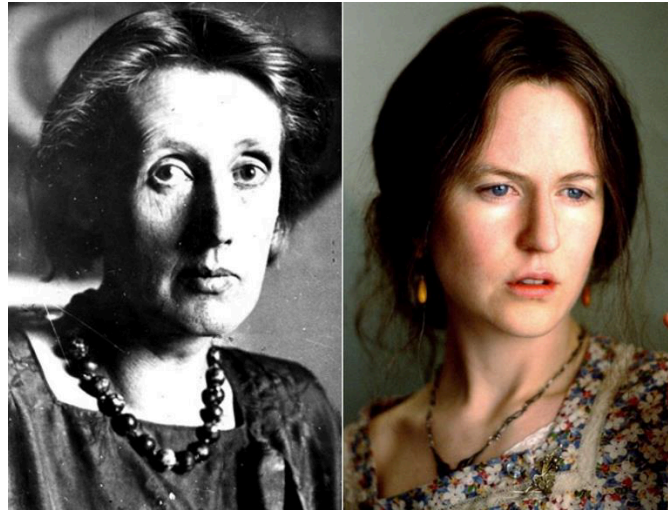
Figure 5. Virginia Woolf/Nicole Kidman in The Hours comparison. (nd). Nicole Kidman as Virginia Woolf [Online image]. Retrieved from http://assets.nydailynews.com/polopoly_fs/1.97226.1475703777!/img/httpImage/image.jpg_gen/derivatives/gallery_1200/nicole-kidman-virginia-woolf.jpg

movie's Virginia Woolf, and that's not just a matter of the fake nose," is sexy in a decidedly unandrogynous mode.