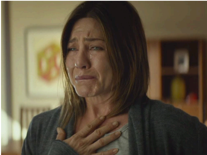
Figure 8. Jennifer Aniston in Cake . Publicity still from Aniston et al. (2014), retrieved from http://www.cinelou.com/cake.html .

In one of the marquee stills from the film (Figure 8), Aniston is crying. Her clothes are shapeless, her hair is unglamorous, and her scars are visible. She looks like a woman in pain. She looks like Jennifer Aniston in pain.