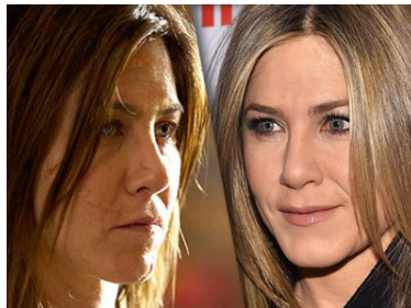
Figure 3. Jennifer Aniston in Cake /Jennifer Aniston comparison.

Nicole Kidman put on a nose. That’s pretty much it. And, actually, that nose did a whole lot of work for her. It didn’t, really, make her ugly, as many of the reviews – critical and otherwise – noted. (And nor should it have.) But it did make her look different – utterly different. (Which noses do, and I think a lot more about the role of noses and their manipulation in a lot of my earlier work.) Again, almost unrecognizable. And again, that’s precisely the point. Nicole Kidman, starlet and ex-wife of Tom Cruise, is a different kind of performer than this woman, star of serious thinking women’s drama.