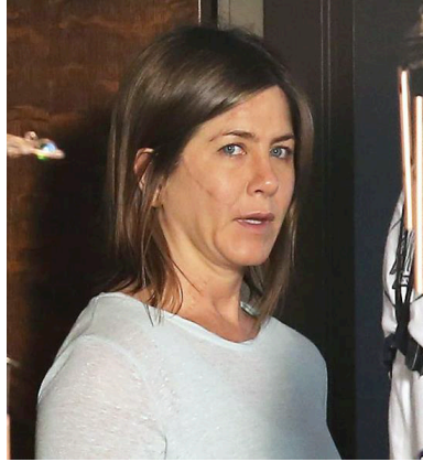
Figure 7. Behind the scenes still of Jennifer Aniston on the set of Cake .