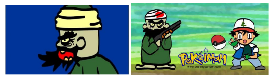
Imam presented as a swearing and violent figure in Pokeimam

help and his sidekick, a bizarre looking creature, Pikachu, comes for help. Imam destroys Pikachu with a huge weapon and leaves a weeping Pokeman behind, he gets inside the mosque.