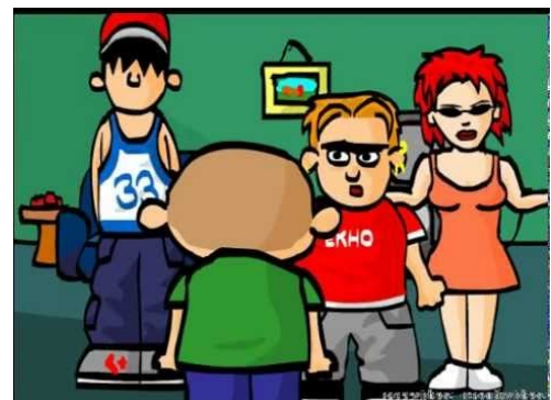
Kemal the Psycho protests the noise by the neighbors.